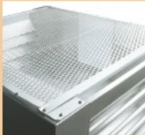
Security System Top Cover