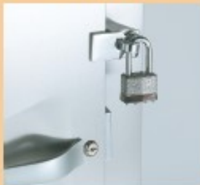
Locking Hasp (padlock by others)