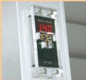
Lexan Control Cover